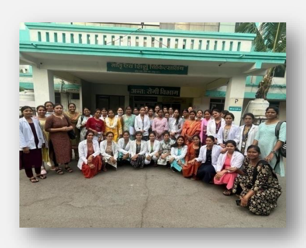
End of day 2